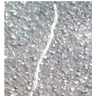
OPM gets its name from the caterpillars' habit of moving in nose-to-tail processions, sometimes on the ground beneath oak trees, as in this picture.

Infested trees are found by professional and volunteer surveyors, tree- and ground-care professionals, and members of the public reporting sightings. We use pheromone trapping in late summer to find adult moths, which provides clues to where we should look the following year.