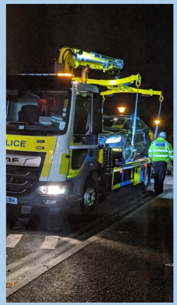
Operation Ghostfreak: Tackling Illegal Car Meets

Running through the heart of Enfield and Haringey the A10 has been infamously blighted by illegal car meetings and street races presenting a significant risk to other road users, pedestrians and residents. As well as posing a great risk to the public illegal car meets taking place in retail parks cause significant disruption to businesses, preventing them from trading and putting off potential customers.