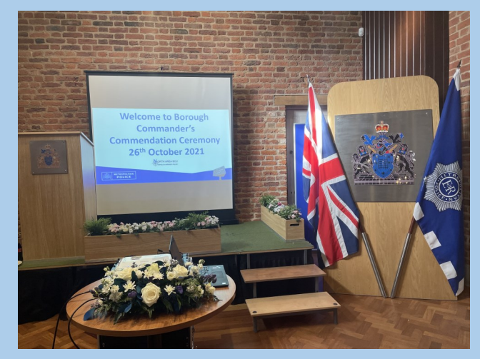
Left: BCU Commander's Ceremony at Forty Hall