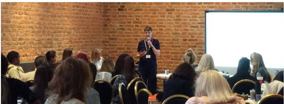
2022 Enfield SENCO Conference: Autistic Girls Hosted by EASA in partnership with parents, schools, NHS, EPS and LA colleagues

We listened! See our website for new referral forms, information and updates to our offer at www.enfieldasa.org.uk